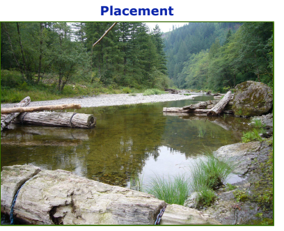
See our Featured Projects

See our celebrations calendar of finished projects.